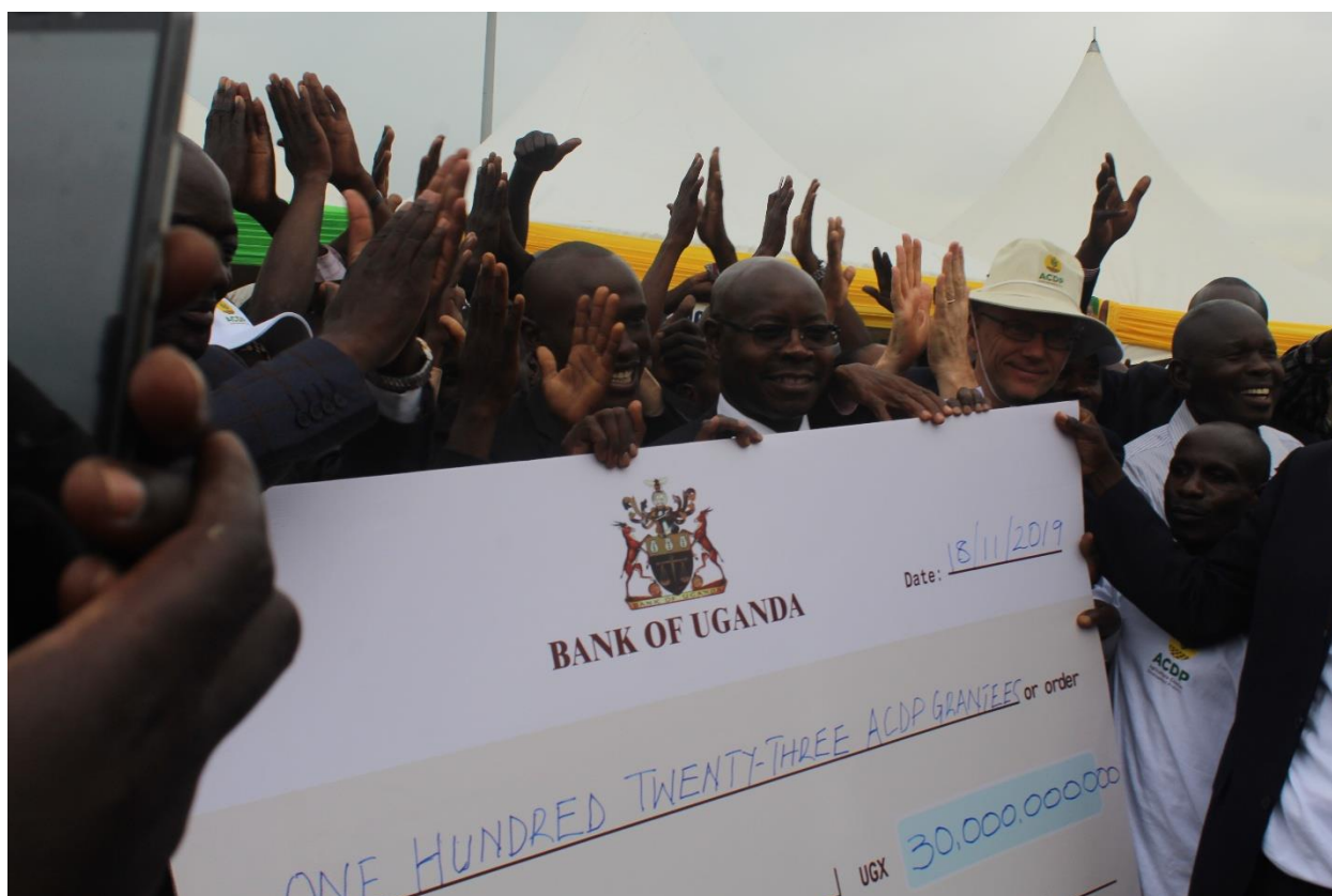
Jubilations as FO leaders receive the dummy cheque from Chief Guest