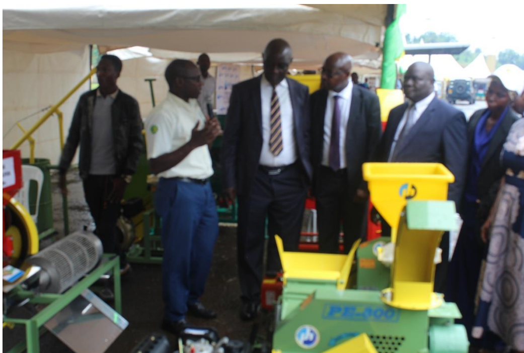
Hon. Vincent B. Ssempijja, Minister of Agriculture, Animal Industries and Fisheries inspecting exhibition stalls during the expo

Venue: Mandela National Stadium Namboole, Wakiso District