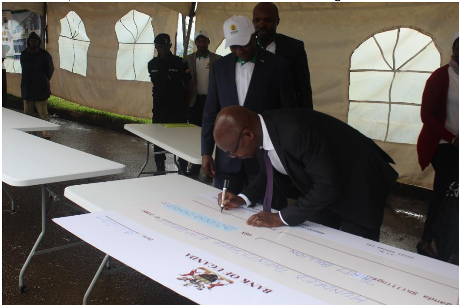
The PS signing the dummy cheque as ACDP Project Coordinator witnesses

A dummy check of Thirty billion Ugandan shillings (UGX 30,000,000,000) was signed by Permanent Secretary MAAIF and thereafter handed over to the group leaders. This handover was witnessed by Chief Guest, World Bank Officials and MAAIF senior management.