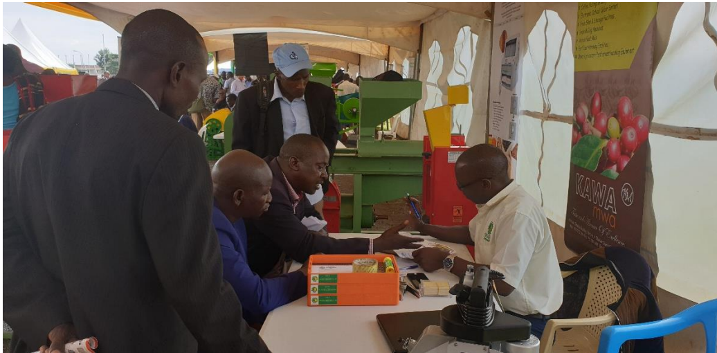
Leaders of FO negotiating with one of exhibitors during the Expo

From the above table, the eight hundred and eighty five invited participants registered at the expo but there are other guests from Exhibitors, media and general public that attended the expo and were not captured.