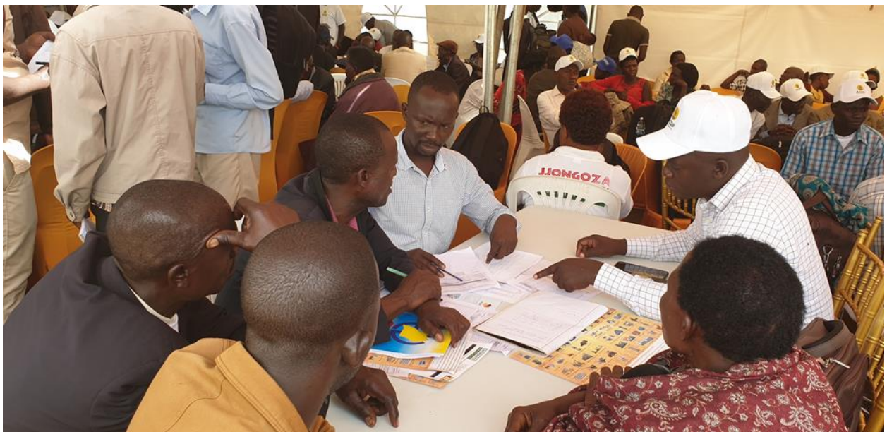
FO leaders examining proforma invoices picked during the expo

At the end of the day, the following FOs got suppliers of selected machinery.