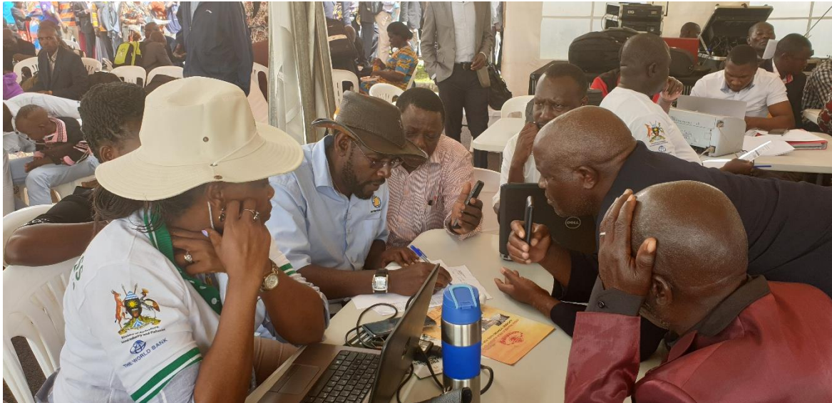
Enterprise Uganda Staff engaging FO leaders on appropriateness of the selected equipment to their needs