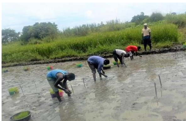
Transplanting in the NPT field - Ngetta ZARDI

Preliminary NPTs are on-going smoothly in the selected four sites (Doho irrigation scheme, Ngetta ZARDI, Ikulwe station of Buginyanya ZARDI and NaCRRI. In Doho, activities like transplanting and gap filling in the NPT field have been concluded. Transplanting has been done at the NPT fields in Ikulwe station, Ngetta ZARDI and NaCRRI.