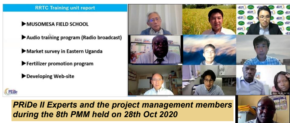
PRiDe II Experts and the project management members during the 8 th PMM held on 28 th Oct 2020

Various meetings have been hold through online platforms like Zoom and SNS, between PRiDe II Project Experts and counterparts in Uganda to share progress of project activities. The 8 th PRiDe Management Meeting (PMM) was held on 28 th October 2020 and progress reports of research and extension activities were shared. Besides that, a number of issues