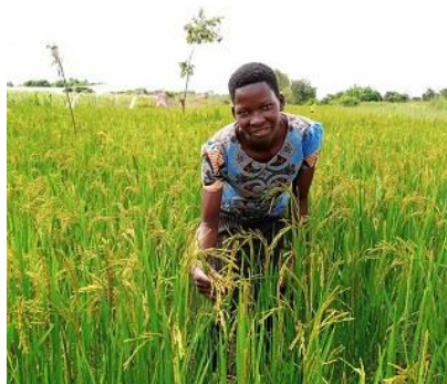
A rice farmer in Oromo village in Lira District excited about getting high yields from her rice field

PRiDe II Musomesa Field School (MFS) is giving an opportunity for farmers to learn rice farming techniques through hands-on practice at the demo sites. Farmers are expected to transfer the skills and knowledge acquired to their rice fields for higher rice yields and better-quality rice. In the lowland MFS demo sites, the importance of fertilizer use is being demonstrated to farmers and in the upland MFS demo sites, farmers are being introduced to small scale seed production to maintain the quality of rice seed. In addition, the Project implemented Monitoring and Evaluation activity in Agweng sub county in Lira District. MFS Graduates of season 2019B were evaluated to assess the impact of Rice Musomesa towards rice techniques and skills dissemination in the community.