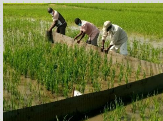
Corrugated plastic iron sheets being set up in Doho NPT field

In Butaleja, Doho Irrigation scheme, weeding was done and corrugated plastic sheets were set up in the experiment field. This will assist in controlling rat damage, give desired irrigation to the experiment plots and also indirectly help in making an effect of fertiliser. Through periodic communication with the ZARDI staff, the Project is able to monitor the field condition in the other sites.