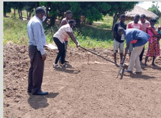
Farmers practicing sowing with a planting fork

trainers of the day. He also urged AOs to effectively utilize the MFS trained farmers to increase rice production in Uganda.