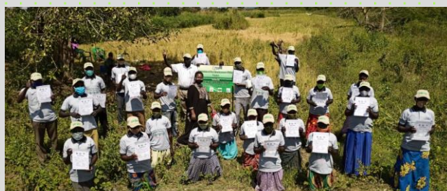
Farmers with their certificates after graduation ceremony