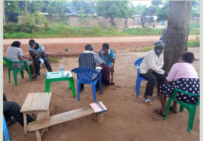
PRiDe II team during the fertiliser start park survey in Mayuge with farmers and agro-chemical shop owners

The idea of developing a fertilizer starter pack was greatly welcomed by both farmers and agro-dealers and when implemented, it is expected to improve farmers' knowledge about fertilisers and their utilisation.