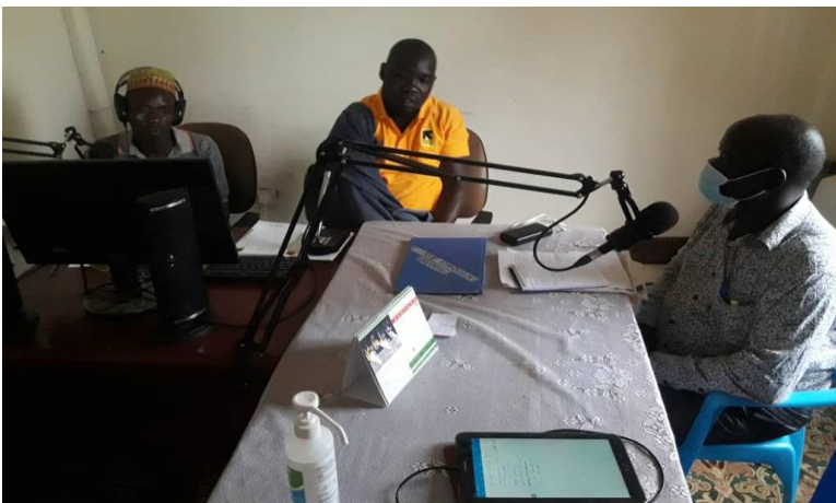
Training of farmers on production of cassava, sesame, sunflower on Radio Ribat, Yumbe town.