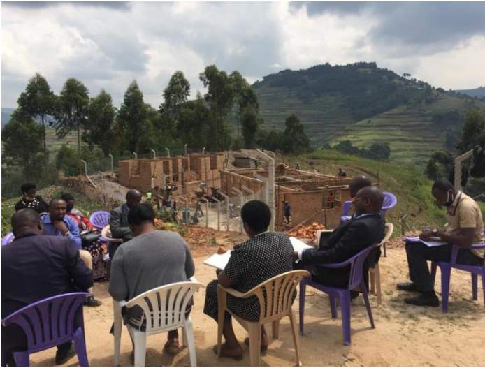
Site meeting with members of the DCT & the political leadership to assess post-harvest infrastructure building works progress- Bufundi Development Association.