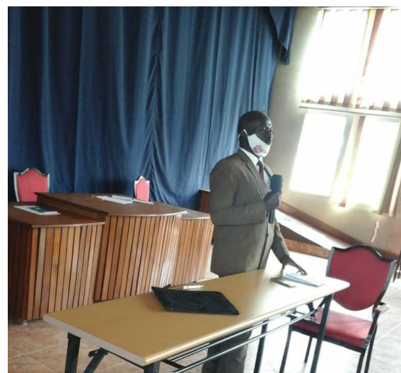
RDC Ntungamo district giving closing remarks at Ntungamo Cluster multi-stakeholder meeting.