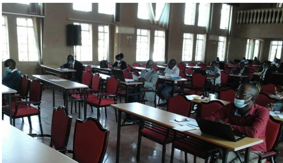
Ntungamo Cluster - Multi-stakeholder meeting chaired by the CAO Ntungamo, in attendance are district Chairpersons, DAOs, DPMO and other stakeholders.