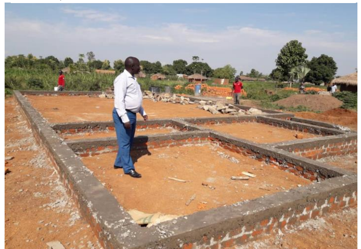
DAO supervising construction works at BInagoro women's group, Midigo Sub county, Yumbe district