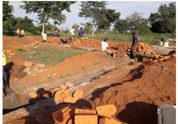
Machine shade construction works at ACTs Draijini subcounty- Yumbe district