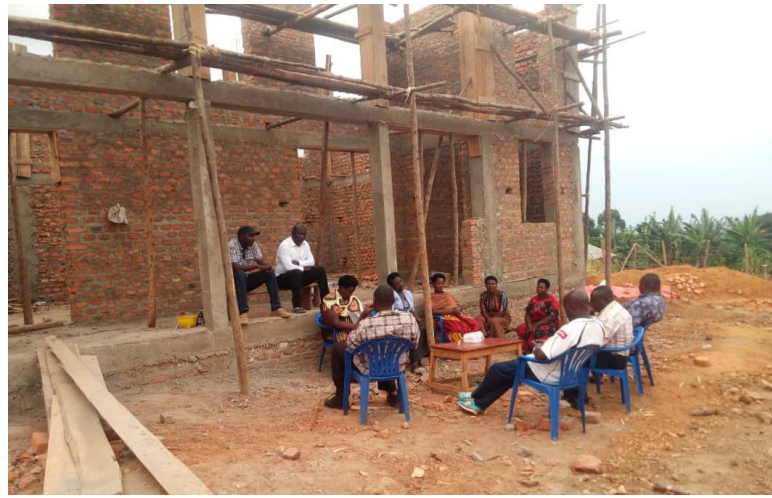
Site meeting with the contractor- Kashate group, Ntungamo district.