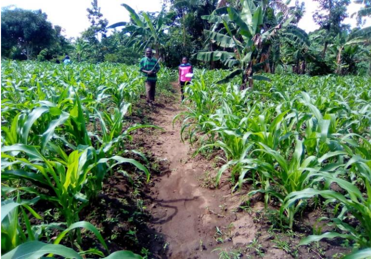
Bonyo Sam of Namanyonyi subcounty in Mbale district integrates SLM on his longe 10 maize field.

In February 2020, ACDP SLM Coordinators trained 51 field extension workers from the 12 coffee pilot districts. These officers were skilled in the integration of sustainable land management and Integrated soil fertility management practices. The training also focused on how to lay out functional field demonstration gardens and local seed multiplication plots.