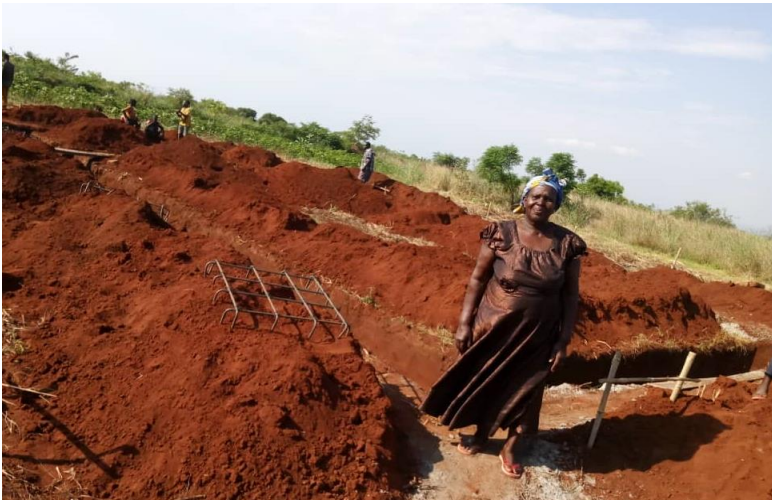
Construction works of store and machine house at Abongo women's group, Nyabang village, Alwi subcounty, Pakwach district.