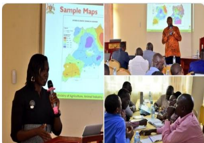
ACDP GIS Specialist speaking at the Workshop.

ACDP held a stakeholder’s consultative workshop to; assess the availability of GIS data; assess the data needs if the different MAAIF sub-sectors; create a common understanding of GIS principles and assess capacity to use GIS techniques.