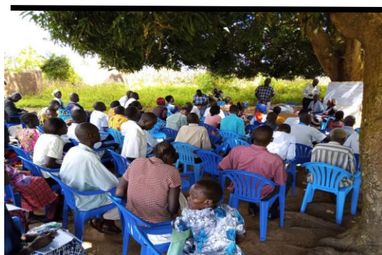
Sensitization session by ACDP/MAAIF Team together with district officials in one of the roll out districts

By December 2019, the total number of farmers enrolled into the e-voucher system had increased from 13,859 farmers (May 2019) to 57,215 farmers (33,719 males and 23,496 females). Cluster One, Kalungu had the highest number of enrolled farmers, while Nebbi Cluster 12, had the lowest enrollment.