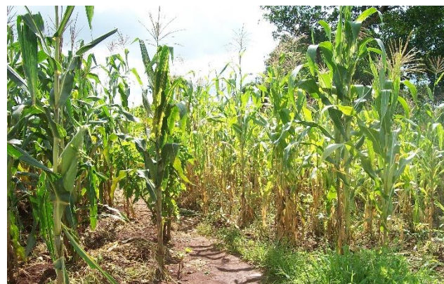
A comparison of Mr Bubwone John, an ACDP farmer's maize garden(left) with an adjacent non-ACDP Maize garden(right)- Iganga district.

The implementation was rolled out to the pilot rollout districts in January 2019. From September, the project was rollout