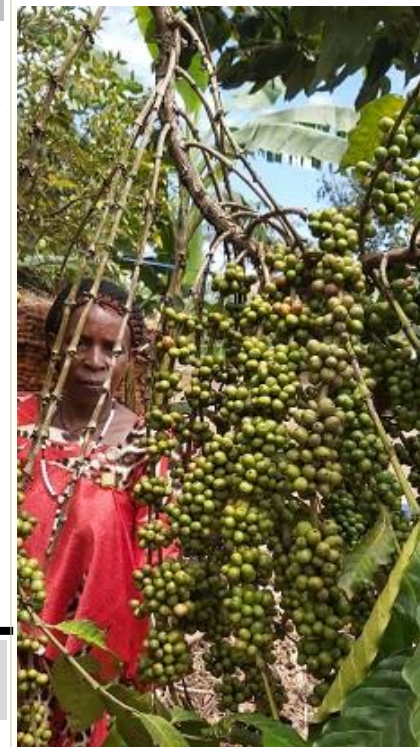
Mrs Mwanje expecting a bumper coffee harvest.