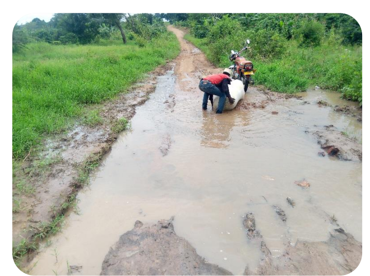
Before: Flooded section of Buwanda swamp, Kalungu district