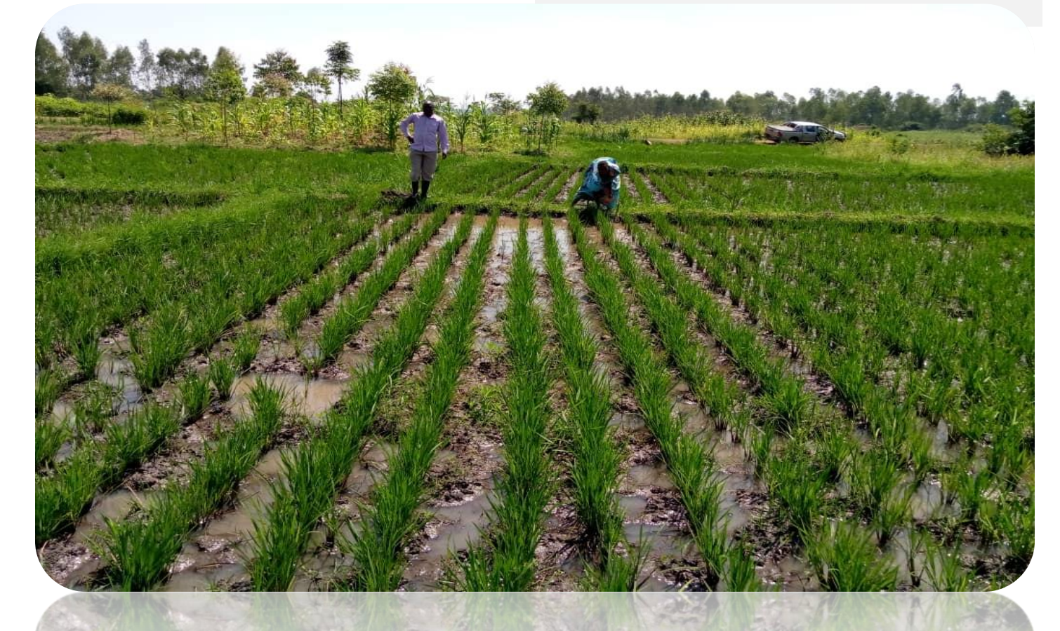
ACDP rice farmer, Iganga cluster

Some of the reasons that can be attributed to the high enrollment levels in these clusters are the highly organized farmer groups and the crops grown in these clusters. For example in Kalungu cluster alone, 55 farmer organizations were awarded Matching grants, In Soroti cluster, 36 farmer organizations submitted business plans and in Ntungamo cluster 28 farmer organizations have been funded for construction of storage facilities and purchase of machinery. The crops grown in these clusters are beans, coffee, cassava, rice and maize.