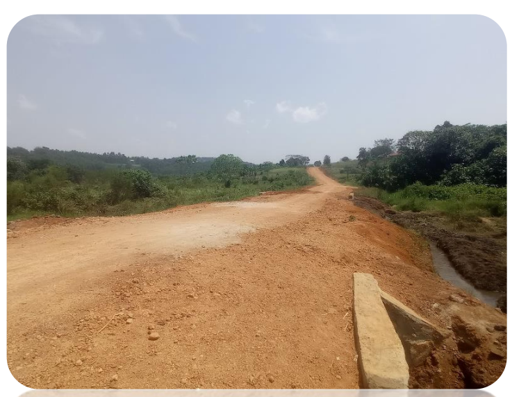
After: The road was raised, filled with marram and culverts installed

ne of the major Investments, the ACDP project has done at the community level is the removal of bottlenecks commonly referred to as "road chokes" on critical farm access roads. This investment primarily targets the removal of bottlenecks that impede transportation to and from areas of production. This is a key strategic output of the project that aims at improving accessibility of production areas to post-harvest handling centres and markets.