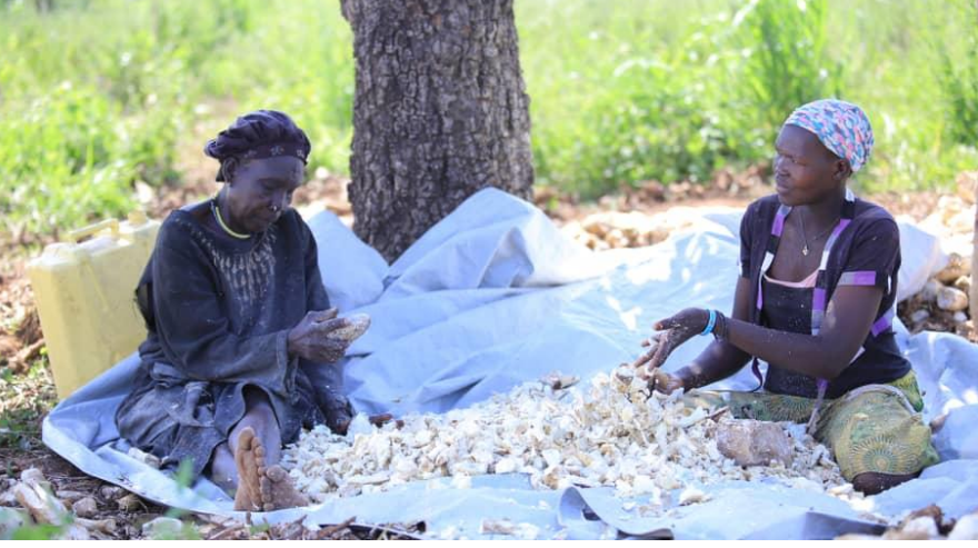
Group members crash cassava into smaller pieces ready for drying