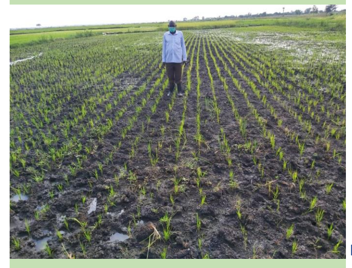
In this demo field, WITA-9 seed was used and the group applied DAP (Phosperous with some nitrogen; and UREA (nitrogen)